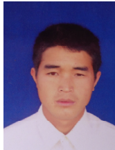
Ban Na My, Muong Toong Village, Muong Nhe District, Dien Bien Province