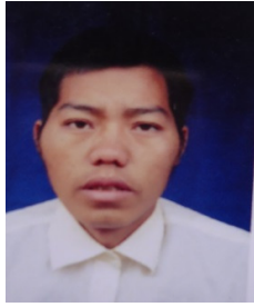
Ban Na Co Sa, Xa Na Co Sa, Muong Nhe District, Dien Bien Province