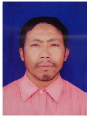
Ban Na My, Muong Toong Village, Muong Nhe District, Dien Bien Province