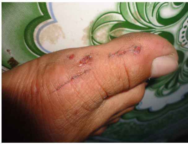
Bruises and scratches all over his body and feet