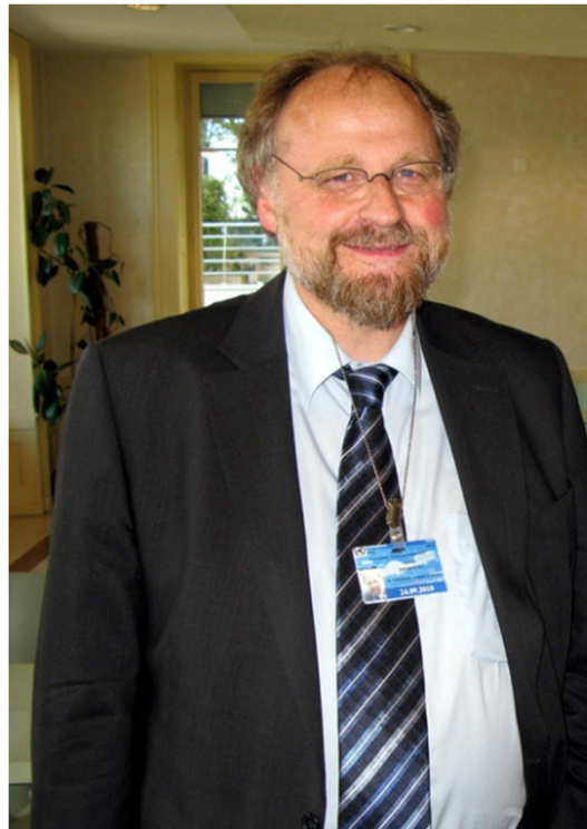
Heiner Bielefeldt, Special Rapporteur on freedom of religion or belief

Special Rapporteurs = Independent Experts