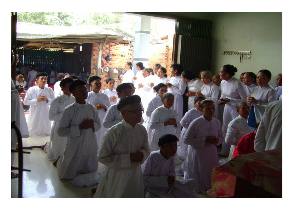
Homeowner closing the gate as the ceremony began.