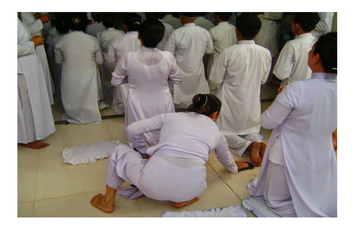
A female participant wiping the floor after garbage landed there.