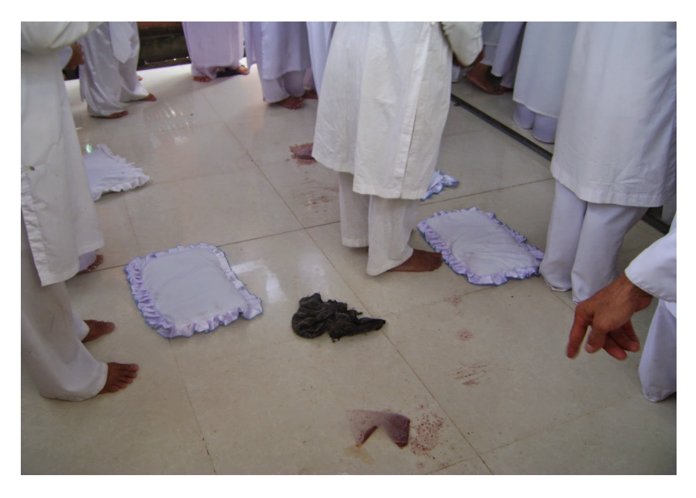
Bags with filthy contents were thrown at the altar's vicinity during the ceremony