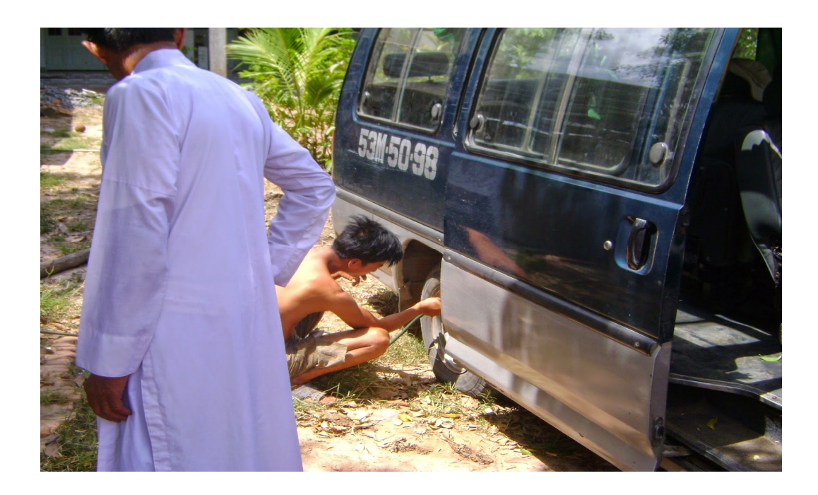
Inflating tires whose air had been let out by assailants.