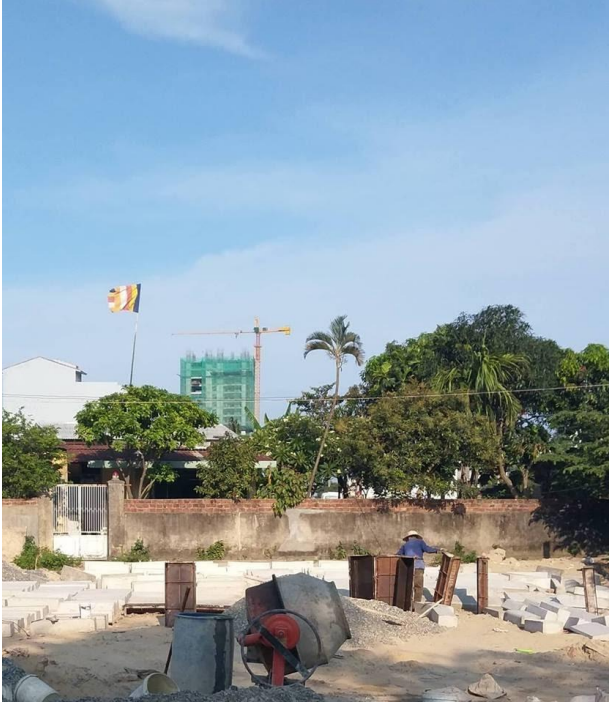
Photo #2: Urban redevelopment construction has started around the temple, making it difficult to conduct religious activities.