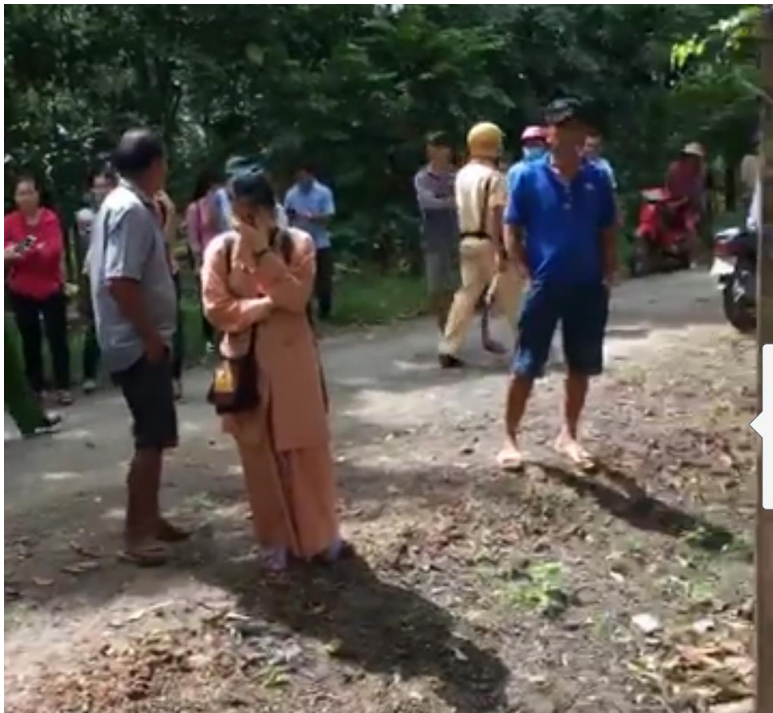
Many of the people participating in the blockade work for the government in various agencies. A number of them appeared embarrassed (e.g., covering their faces), but they had to do what senior police and government officials had ordered them to do, i.e, assisting in the government's religious persecution.