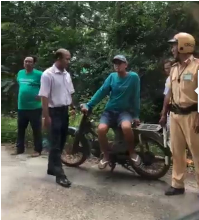
These pictures shows state agents in uniforms and plainclothes harassing and preventing the monks from proceeding to the temple.