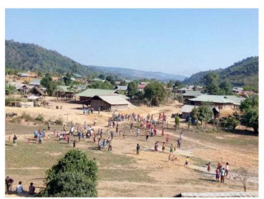
A section of Area 179, Liên Srônh Commune, Đam Rông District, Lâm Đồng Province

Thanks to international attention, in early 2020, the Government of Dam Rong District, Lam Dong Province signaled a positive policy shift towards the Hmong residents in Subdivision 179 of Lien Sronh Commune. This community of 700 residents was founded approximately two decades ago by Hmong Christians who fled or were evicted from their home villages in the Northwestern Highlands because of their Christian faith after 20 years without any doccuments.