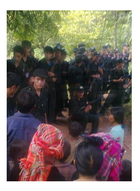
Troops ready to raze the entire H'Mong village of Xa Na Khua, Jan 28, 2011