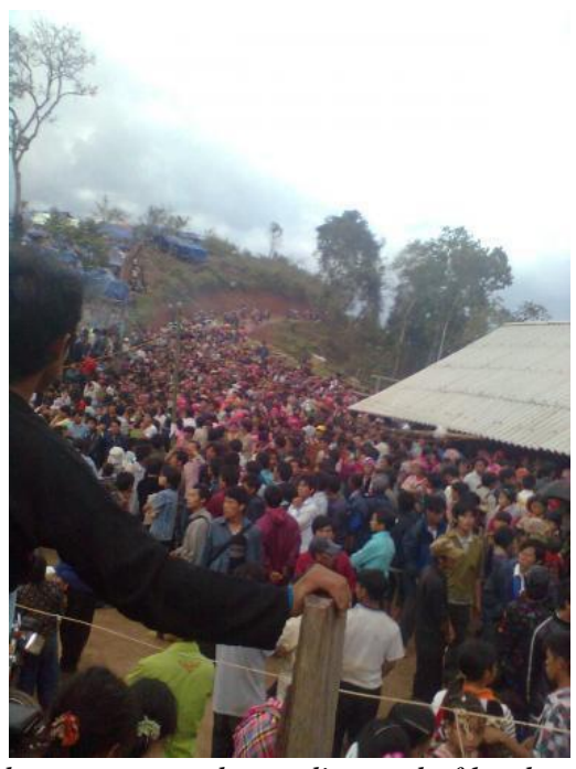
Thousands of H'Mong demonstrators demanding end of land confiscation and religious persecution, May 1, 2011

The next day, the troops launched an all-out assault, using batons and electric rods. <sup>14</sup> According to eye-witnesses, scores of H'Mong demonstrators were killed.