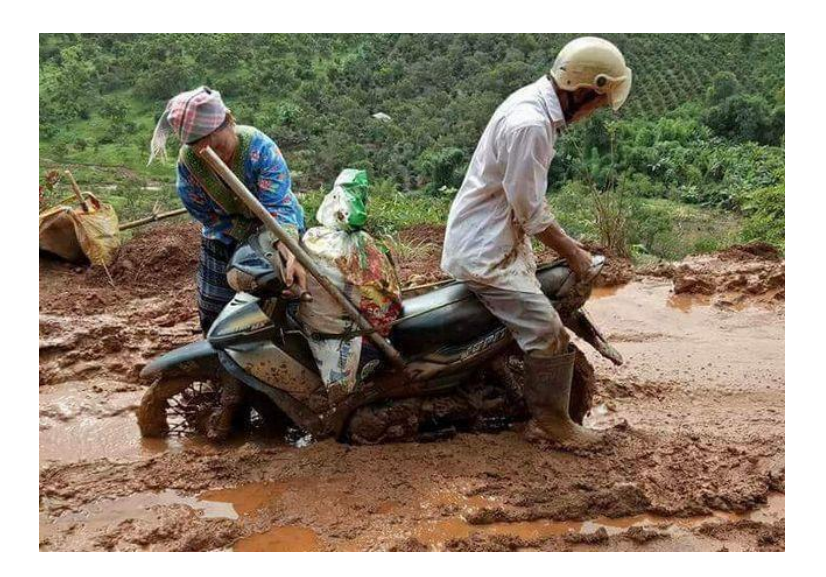
The only road leading to Doan Ket Village became unusable after heavy rain.

National aid and development programs as well as budget allocated for resettling H'Mong who had moved to the Central Highlands have apparently not reached Doan Ket Village. Living conditions in these settlements remain poor. The abominable transportation infrastructure severely hampers travel and commerce. Roads are dusty in the dry season and muddy in the rainy season. Several sick persons and pregnant women have died on the way to hospitals. Few villagers have access to quality health care. Coffee growing, the primary means of livelihood of most villagers, is often affected by the area's inclement weather. Communication infrastructure is very primitive, with no internet and weak cell phone signals. Few local residents are familiar with communication technologies or have access to a computer or a smartphone. A human rights advocate who visited government-managed settlements of displaced H'Mong described them as a Soviet-style "gulag."