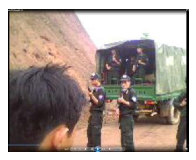
Troops, armed with weapons and live ammunition, encircling the demonstrators, May 4, 2011.

The military troops and the police arrested many demonstrators and took them into custody. Those who escaped arrest were tracked down in the following months by the police. Reportedly hundreds of demonstrators hid themselves in the jungle. Many had since been captured while a number successfully made it to Thailand after months of trekking through Laos. One H'Mong Christian from Dak Lak Province who had participated in the demonstration was shot dead as he ran away from the approaching police.