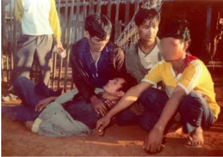
Fig 2. Montagnard demonstrators were beaten by government security forces during mass protests in February 2001 against land confiscation and religious repression in the Central highlands