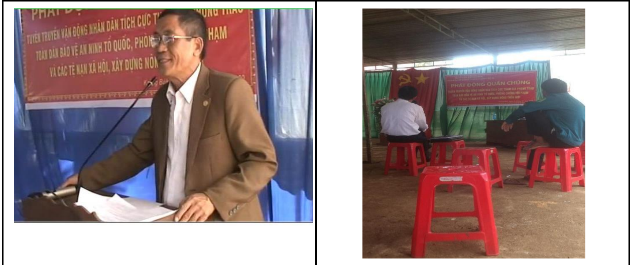
Figs. 7 and 8. Other scenes of the public denunciation event