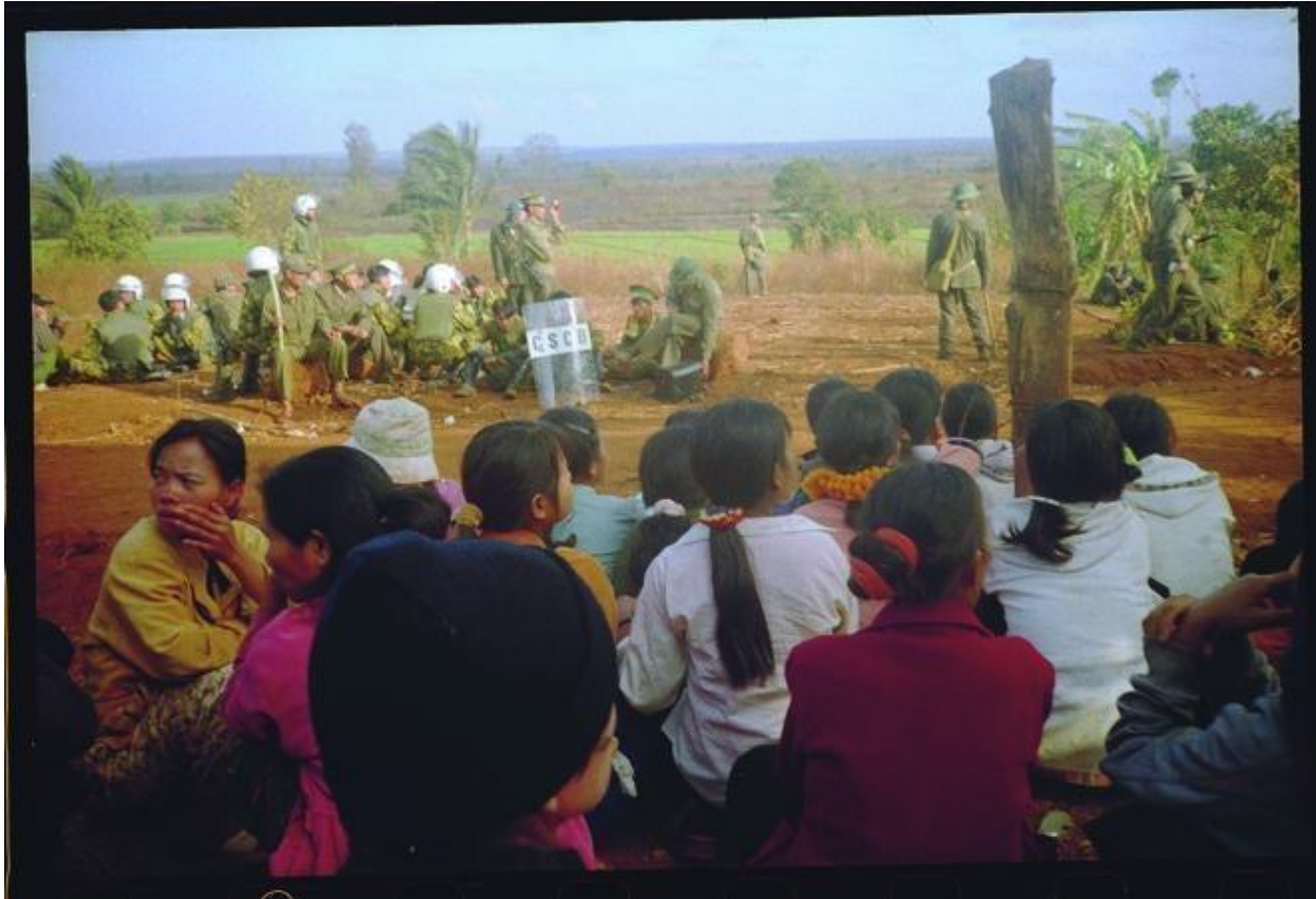
Fig 1. Jarai women in Plei Lao village, Gia Lai province, where Mobile Intervention Police broke up an all-night prayer meeting in March 2001, fired on villagers – killing one – then burned the village church.